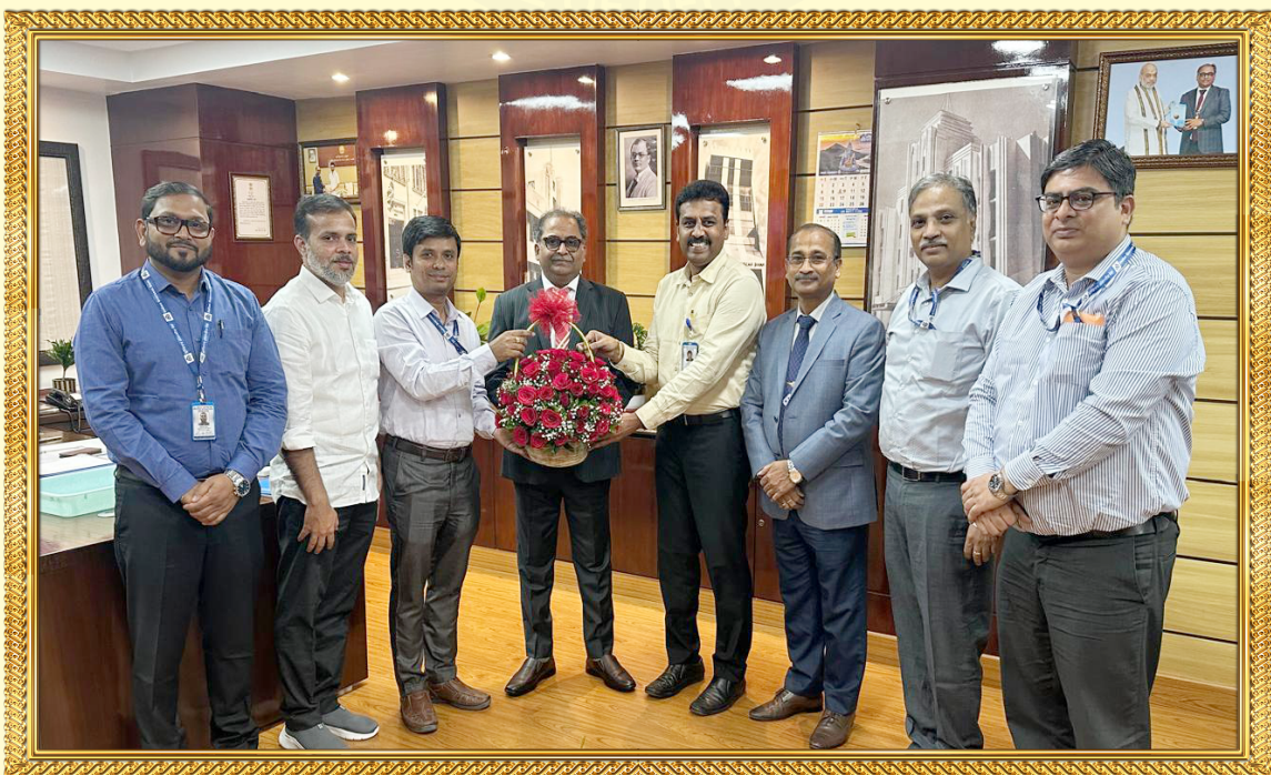
Warm reception extended by our beloved MD & CEO alongwith GM (HR)

BRING IN NEW CONNECTION/LEAD FOR THE GROWTH OF THE BANK.