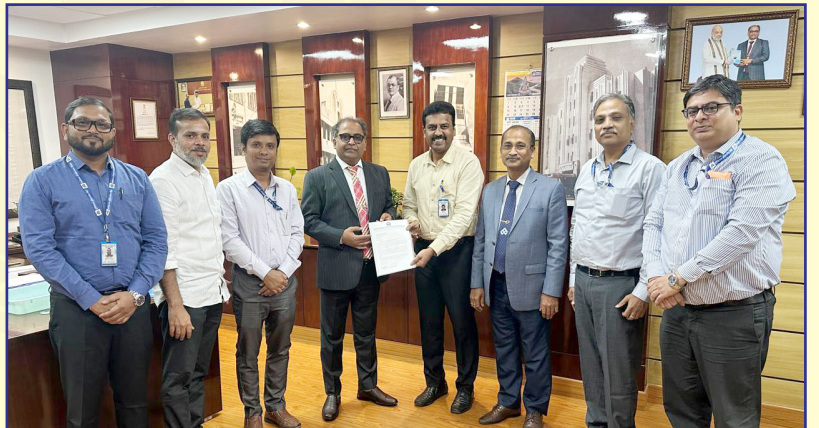
Defining moment in the history of IOBOF